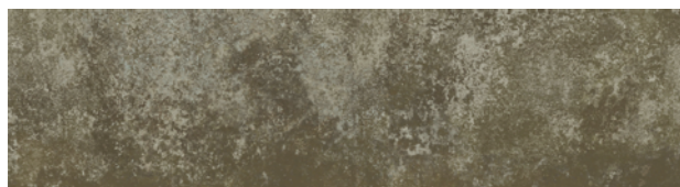
A00607 DESERT SHADOW