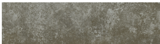
A00609 MORNING MIST