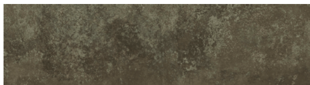
A00608 EVENING DUSK